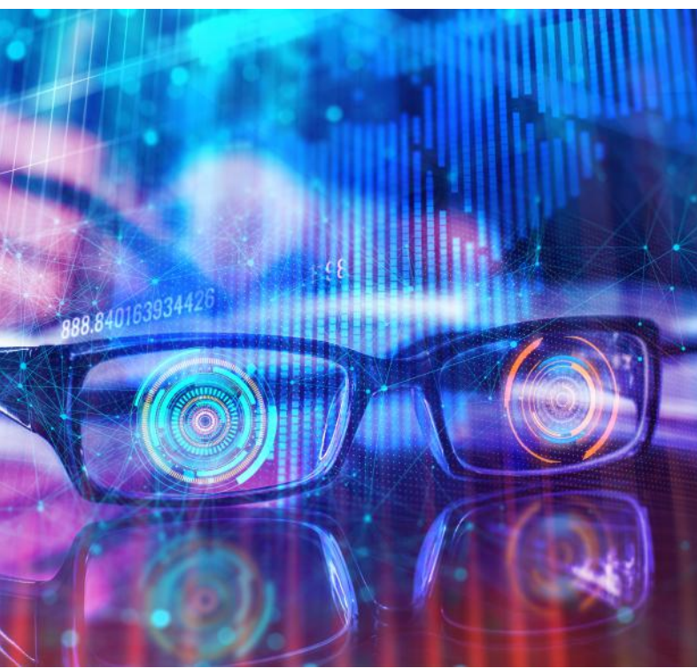
Image processing is playing an ever-important role in security (such as facial and fingerprint recognition) and medical research and practice (such as the diagnosis of various diseases). Signal processing is the foundation for making sense of various information obtained from wearable devices and Internet of Things. Indeed, it is an exciting era to see our society being transformed by technology.